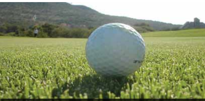
Primo Maxx increases the density of turf, creating a better playing surface. Reducing the hours spent mowing releases time and money for more productive management around the course.

Input cost rises have dramatically increased mowing costs over the past year – creating even greater cost savings with a Primo Maxx programme.