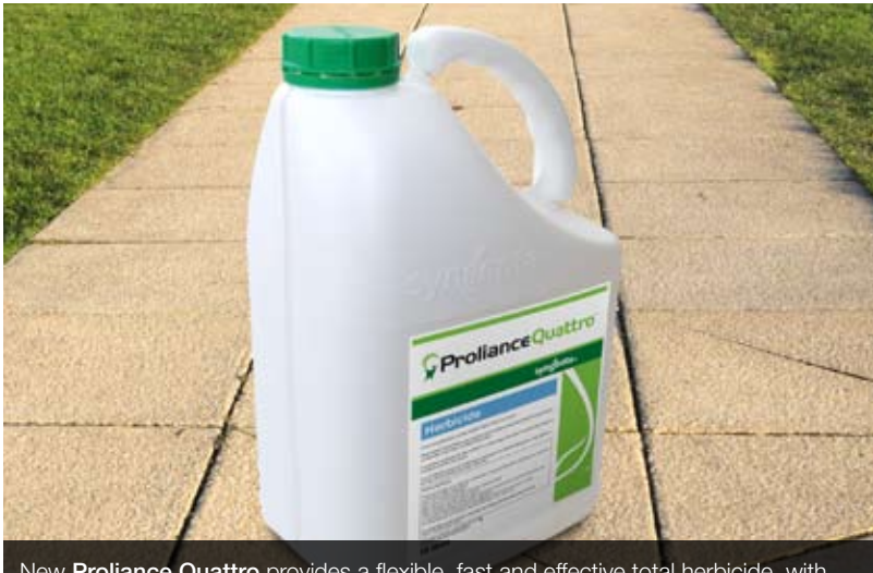
New Proliance Quattro provides a flexible, fast and effective total herbicide, with specific beneficial features for professional grounds maintenance.

Works faster and more effectively in a wider range of conditions