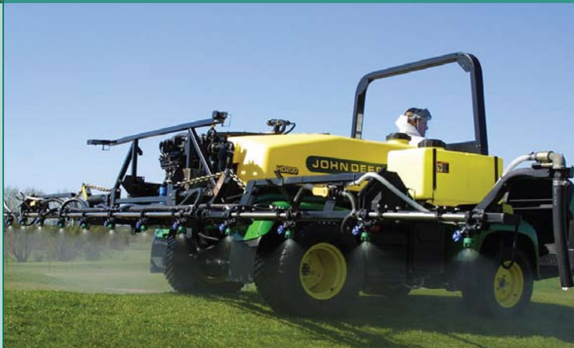
Proactive fungicide programmes will deliver better quality turf and, where used effectively, will do so at lower cost and with fewer fungicide applications.