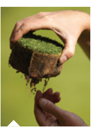
Root uptake of Medallion TL and targeting disease pathogens in the thatch will lower infection risk and give long lasting results.

"Furthermore, studies have shown that there is some root uptake and movement of the Medallion TL active within the plant from earlier applications in the autumn," he reported. "That could be further contributing to the long lasting results."