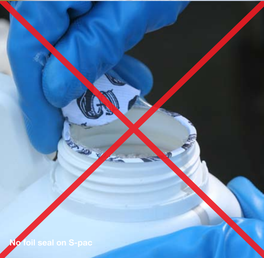
No foil seal on S-pac