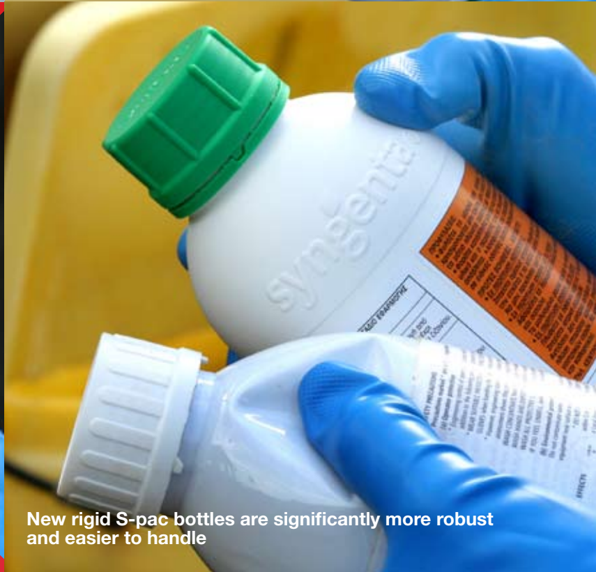
New rigid S-pac bottles are significantly more robust and easier to handle