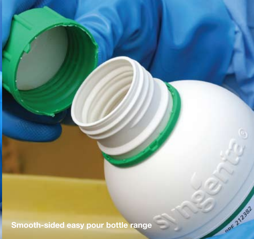
Smooth-sided easy pour bottle range