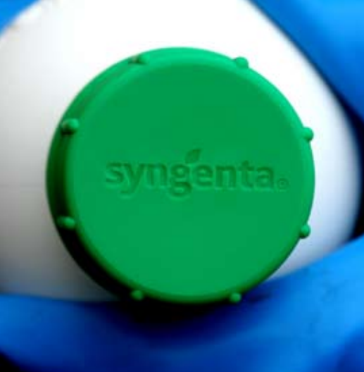
Tamper-evident security cap