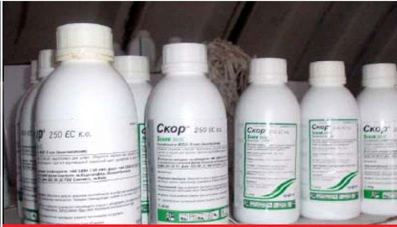
Counterfeit bottles re-filled