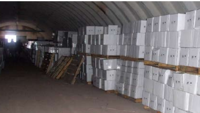
Counterfeit product destined for Europe