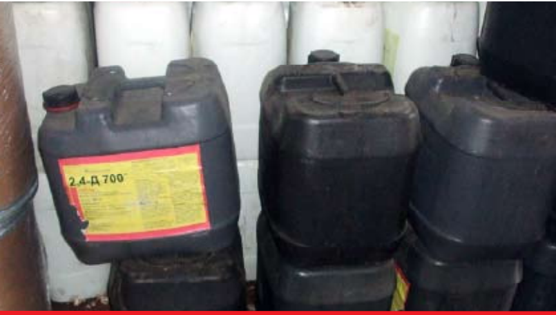
Stored fake product leaking