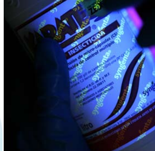
Exclusive Syngenta label, with varnish logo