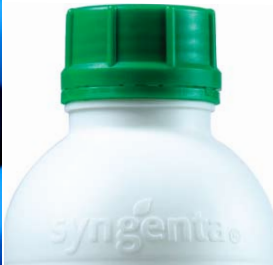
Unique Syngenta embossed bottle design