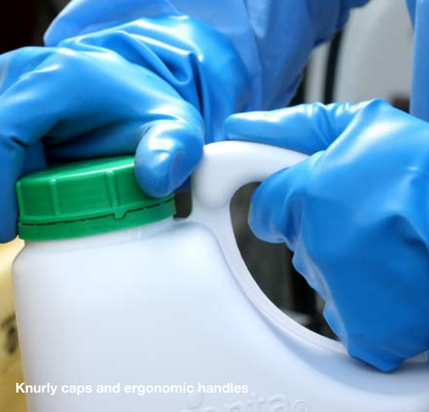
Knurly caps and ergonomic handles